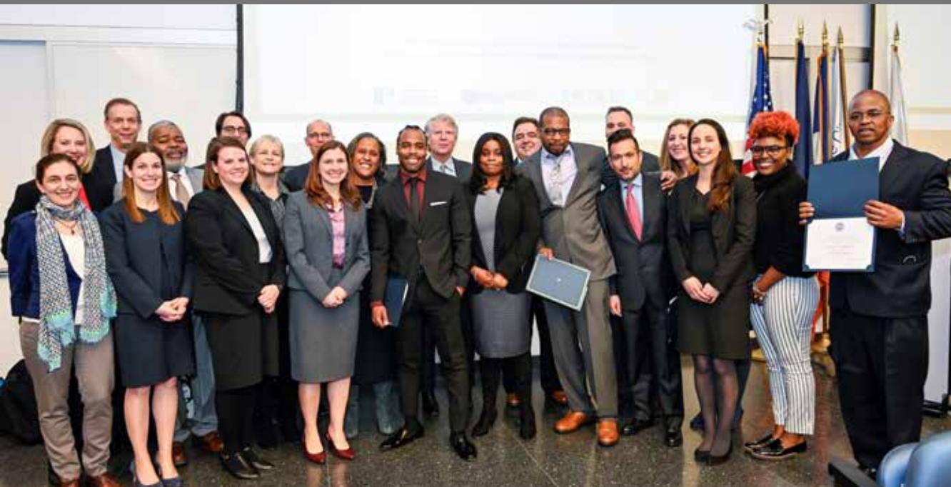
Third ICJ graduation at John Jay College of Criminal Justice. March 2019.

Inside Criminal Justice, a joint initiative of The Manhattan D.A. Academy, the Institute for Innovation in Prosecution at John Jay College of Criminal Justice, and the Center for Justice at Columbia University, is a semester-long seminar comprised of individuals incarcerated at Queensboro Correctional Facility and prosecutors from the Manhattan District Attorney's Office.